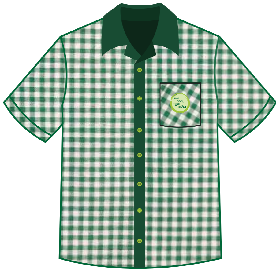
Shirt Front Face