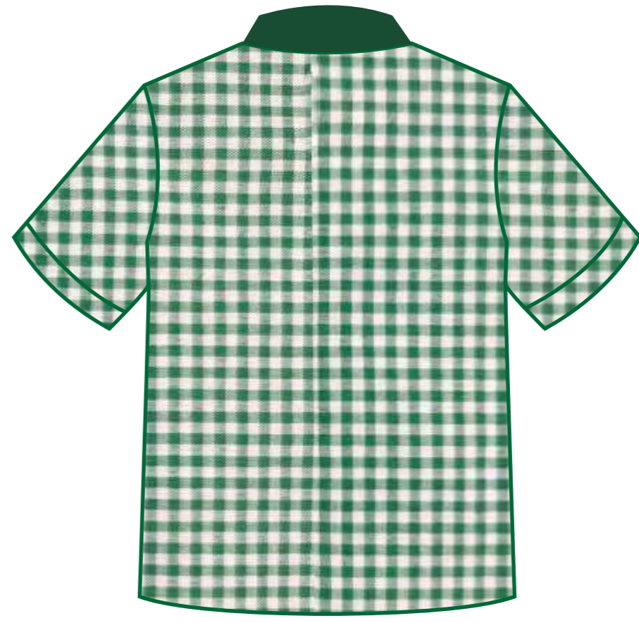
Shirt Back Face