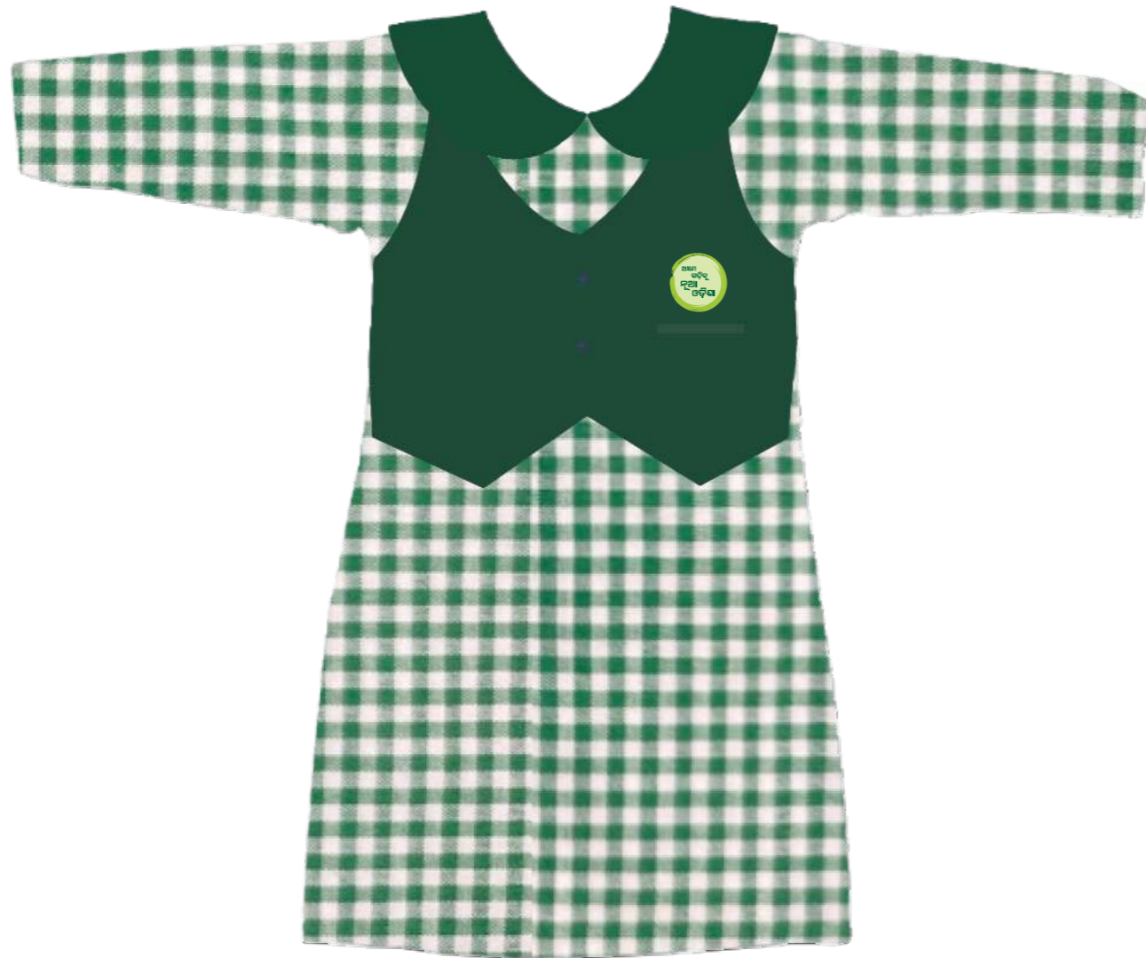
Shirt Front Face