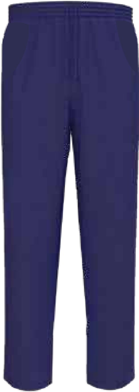
PANT SIDE AND FRONT